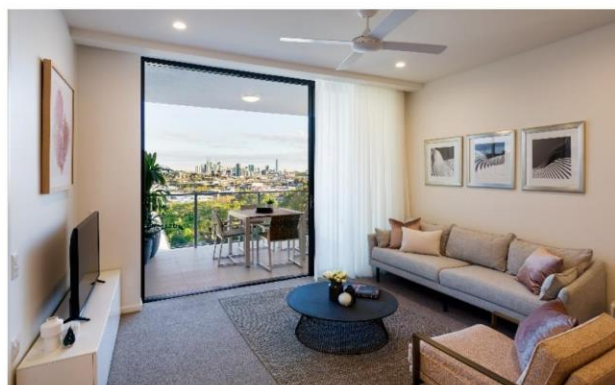
2 bed, 2 bath apartments from $439,000*

*Price correct at 23/08/18. Image is of apartment S403