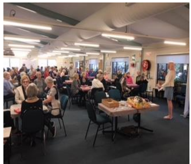
Good Samaritan Housing presentation