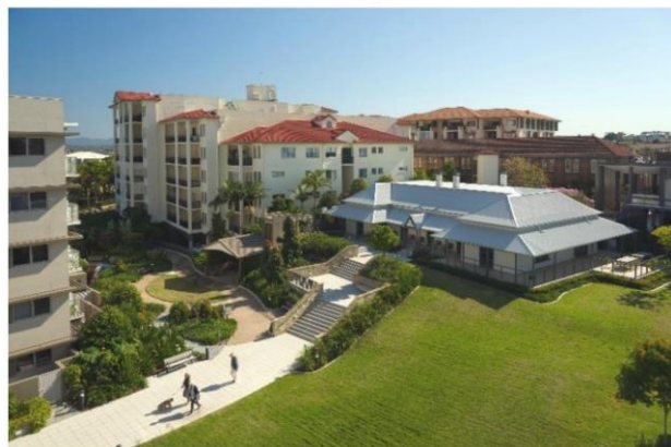
The Clayfield Lawn & Highlands House.

Find out more at www.theclayfield.com.au or Call 13 28 36 to book a tour today.